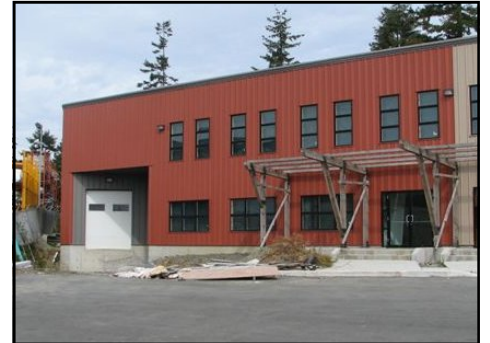
Unit A - 5,052 sq ft