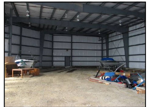
Interior view of unit