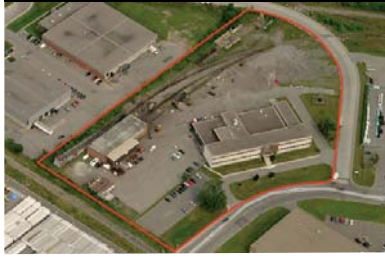
3950 Hickmore Street Saint-Laurent

Single occupant property 48,659 sq ft 10' and 18' clear