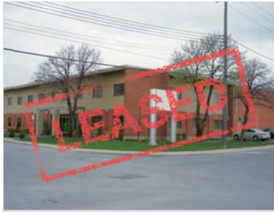
1930 1960 52 nd Avenue Lachine

Multi tenant property ± 30,000 sq ft 19'10" clear 1 ground-level door 2 truck-level doors