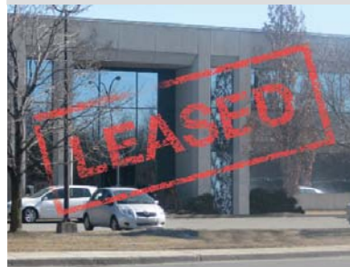
3155 3185 J.-B.-Deschamps Blvd Lachine

Multi tenant property ± 15,000 sq ft 24' clear 2 truck-level doors