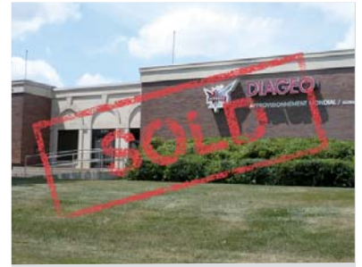
2101 Trans-Canada Highway Dorval

Multi tenant property ± 30,000 sq ft 19'10" clear 1 ground-level door 2 truck-level doors