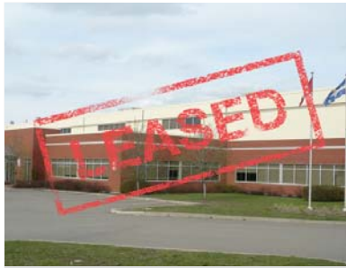
4400 Hickmore Street Saint-Laurent

Single occupant property 57,786 sq ft 20' to 28' clear 1 ground-level door 3 truck-level doors