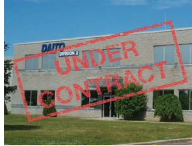
4005 Sartelon Street Saint-Laurent

Single occupant property 48,659 sq ft 10' and 18' clear