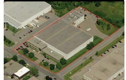
2825 Brabant-Marineau Street Saint-Laurent

Single occupant property 81,236 sq ft 18' to 33' clear 7 truck-level doors