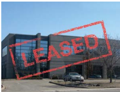
3105 J.-B.-Deschamps Blvd Lachine

Multi tenant property ± 15,000 sq ft 24' clear 2 truck-level doors