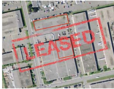
1930 1960 52 nd Avenue Lachine

Multi tenant property ± 30,000 sq ft 19'10" clear 1 ground-level door 2 truck-level doors