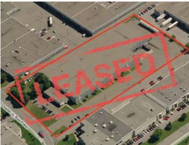
4500 Chemin Bois-Franc Saint-Laurent

Single occupant property 79,936 sq ft 24' clear 2 ground-level doors 4 truck-level doors