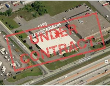
4225 Trans-Canada Highway Pointe-Claire

Single occupant property 62,740 sq ft 23' clear 1 ground-level door 8 truck-level doors