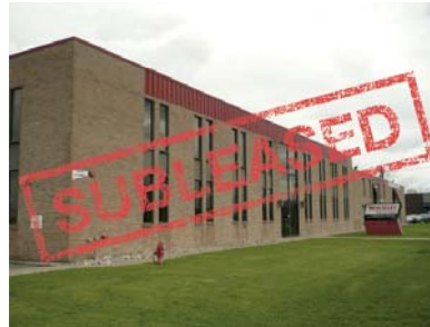
4953 de la Côte-Vertu Blvd Saint-Laurent

Multi tenant property ± 15,000 sq ft 16' clear 2 truck-level doors