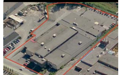
3540 Saint-Patrick Street Montréal

Single occupant property 58,515 sq ft 10' to 22' clear 3 truck-level doors