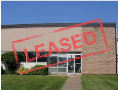
4747 Bourg Street Saint-Laurent

Single occupant property 77,500 sq ft 24' clear 1 compactor door 3 truck-level doors