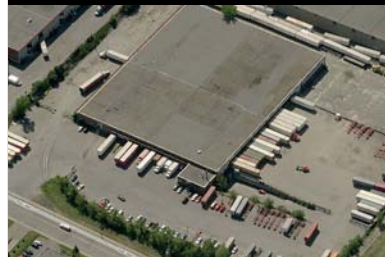
2698 Léger Street LaSalle

Multi tenant property ± 25,000 – 104,000 sq ft 12' clear 2 truck-level doors