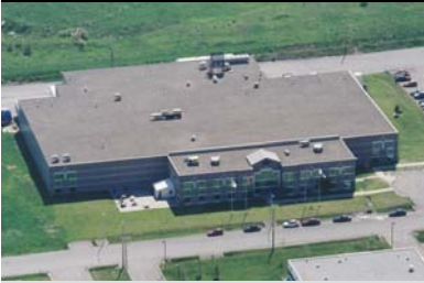
3765 La Vérendrye Street Boisbriand

Single occupant property 43,900 sq ft 24' clear 3 truck-level doors