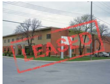
1930 1960 52 nd Avenue Lachine

Single occupant property 47,752 sq ft 25' clear 5 ground-level doors