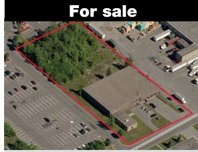
835 Ellingham Avenue Pointe-Claire

Multi tenant property 29,187 sq ft 18' clear 2 ground-level doors 4 truck-level doors