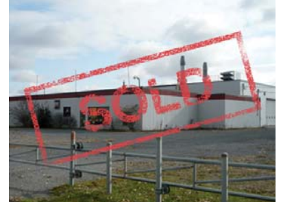
51 53 Principale Street Saint-Damase

Single occupant property 39,826 sq ft 12', 16' and 18' clear 3 ground-level doors 4 truck-level doors