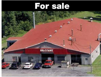
1345 Jacques-Cartier Street S. Saint-Jean-sur-Richelieu

Single occupant property ± 22,000 sq ft 18' clear 4 ground-level doors 1 truck-level door