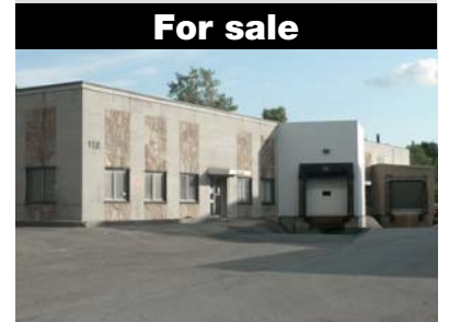
112 Leacock Avenue Pointe-Claire

Single occupant property 91,220 sq ft 24' clear 136 exterior parking stalls