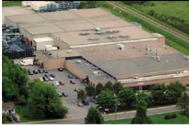
16 Richelieu Street Lacolle

Multi tenant property 112,343 sq ft 18' and 20' clear 1 ground-level door 4 truck-level doors