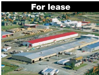
125 Du Parc Avenue Saint-Joseph-de-Beauce

Single occupant property 116,230 sq ft 13' and 25' clear 7 ground-level doors 3 truck-level doors