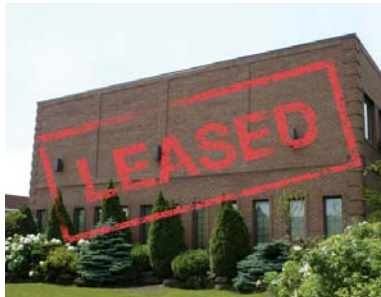
8600 8620 Chemin Darnley Town of Mount Royal

Single occupant property 10,360 sq ft 17' clear 1 ground-level door 1 truck-level door