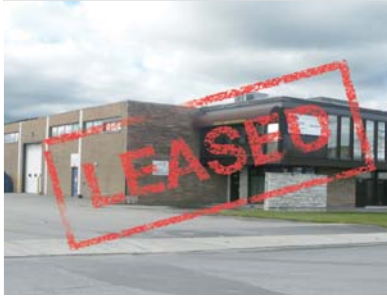
888 Montée-de-Liesse Saint-Laurent

Single occupant property 17,291 sq ft 18' clear 3 truck-level doors