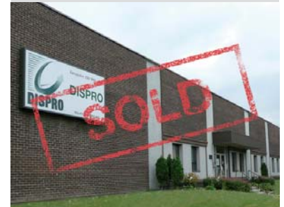
10280 Ray-Lawson Blvd Anjou

Multi tenant property ± 7,000 sq ft 15' and 20' clear 2 ground-level doors 2 truck-level doors (1 interior)