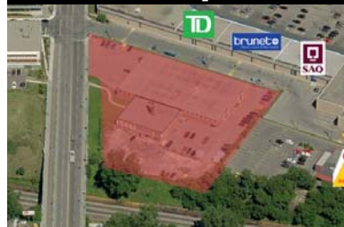
2900 2940 Rachel Street Rosemont

90,560 sq ft Industrial zoning I.4B.7B Adjacent to Technopôle Angus