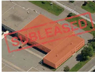
2615 2625 Brabant-Marineau St. Saint-Laurent

Single occupant property ± 25,000 sq ft 21' clear 1 ground-level door 4 truck-level doors