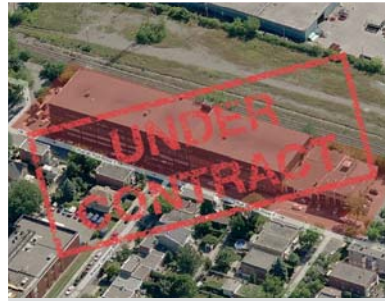
1000 1100 Port-Royal St. E. Ahuntsic-Cartierville

Multi tenant property 30 September 2014 36,559 sq ft 21' clear 10 truck-level doors