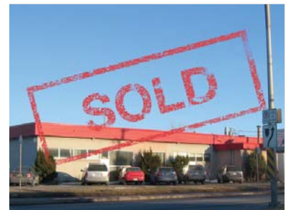
365 Ch. du Grand Bernier Nord Saint-Jean-sur-Richelieu

Multi tenant property 22,375 sq ft 18' clear 1 ground-level door 4 truck-level doors