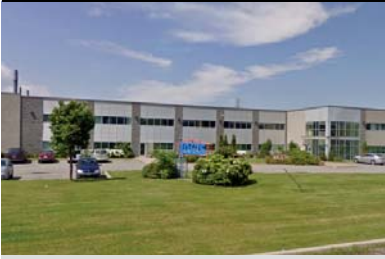
20675 Industriel Blvd Sainte-Anne-de-Bellevue

Single occupant property ± 25,000 sq ft 21' clear 1 ground-level door 4 truck-level doors