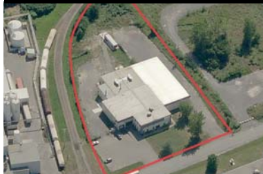
19300 Clark-Graham Avenue Baie-d'Urfé

Single occupant property 26,880 sq ft 18' and 20' clear 6 ground-level doors 1 truck-level door