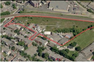
Saint-Ferdinand Street Montréal

± 10,000 – 240,000 sq ft Close proximity to downtown Short or long term lease