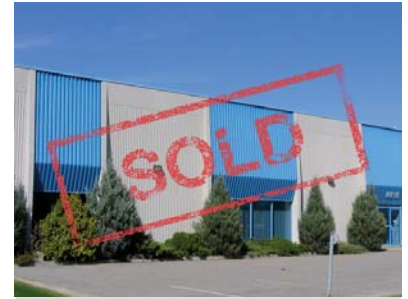
8515 Henri-Bourassa Blvd W. Saint-Laurent

Single occupant property 137,250 sq ft 11'8" and 16'8" clear 3 ground-level doors 6 truck-level doors