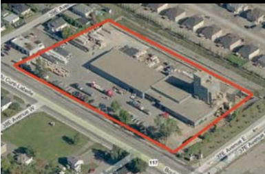
650 Curé-Labelle Blvd Blainville

142,902 sq ft Commercial zoning (C1, C2, C3, C4 including C7) Fully serviced