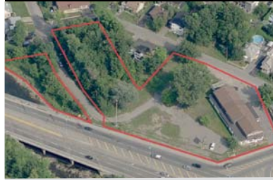
7 Grand Boulevard Île-Perrot

77,711 sq ft Residential/Commercial zoning Great exposure on Highway 20