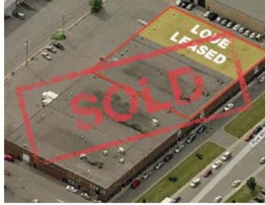
650 670 McCaffrey Street Saint-Laurent

Single occupant property 184,268 sq ft 22' and 24' clear 5 ground-level doors 3 truck-level doors