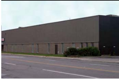
6755 6801 des Grandes-Prairies Blvd Montréal

Multi tenant property 281,251 sq ft 22' clear 1 ground-level door 19 truck-level doors