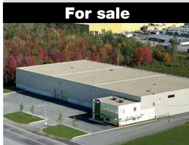
1750 Janelle Street Drummondville

Multi tenant property 40,000 – 81,328 sq ft 27' clear 1 ground-level door