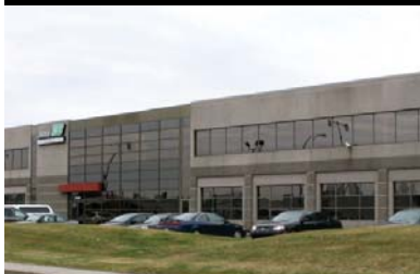
18050 Trans-Canada Highway Kirkland

Multi tenant property 24,515 sq ft 25' clear 1 truck-level door