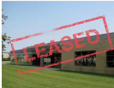
70 Hymus Blvd Pointe-Claire

Single occupant property 91,220 sq ft 24' clear 136 exterior parking stalls