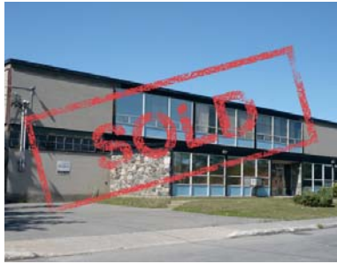
8489 8491 Ernest-Cormier St. Anjou

Multi tenant property 281,251 sq ft 22' clear 1 ground-level door 19 truck-level doors