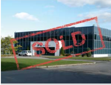
500 Léger Street Rivière-Beaudette

Single occupant property 184,268 sq ft 22' and 24' clear 5 ground-level doors 3 truck-level doors