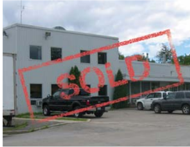
29 33 Elm Street Grenville

Multi tenant property 112,343 sq ft 18' and 20' clear 1 ground-level door 4 truck-level doors