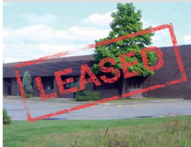
141 Barr Street Saint-Laurent

Single occupant property 116,230 sq ft 13' and 25' clear 7 ground-level doors 3 truck-level doors