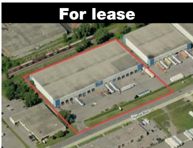
1405 Hymus Blvd Dorval

Single occupant property 10,491 sq ft 10' and 14' clear 2 ground-level doors 1 truck-level door