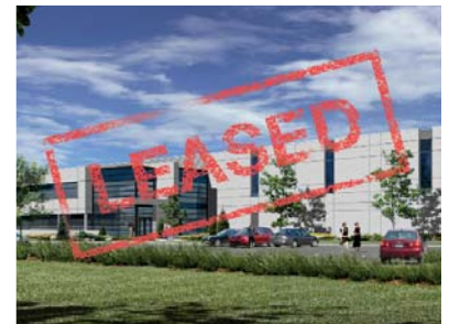
19700 Clark-Graham Avenue Baie-d'Urfé

Single occupant property 26,880 sq ft 18' and 20' clear 6 ground-level doors 1 truck-level door