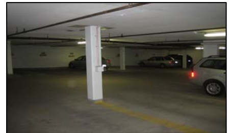
Underground Secure Parking