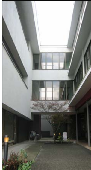
Upward view from Atrium

The subject property is located on the southeast corner of Cook and View Streets, just four blocks east of the Downtown Victoria's financial core, and a half block off of Fort Street. It is within close proximity to the Harris Green Neighborhood, Antique Row and Cook Street Shopping Village, an eclectic neighborhood just blocks from Beacon Hill Park and Dallas Road. A myriad of specialty retail shops, cafes and restaurants and other services abound on the adjacent streets, providing a wide range of amenities within easy walking distance of the subject property. Nearby restaurants include Moxie's Bar & Grill, J.J. Wonton Noodle House and the Blue Fox Café. The subject property's proximity to the city centre, access to transit and its urban streetscape make it a desirable place to work.